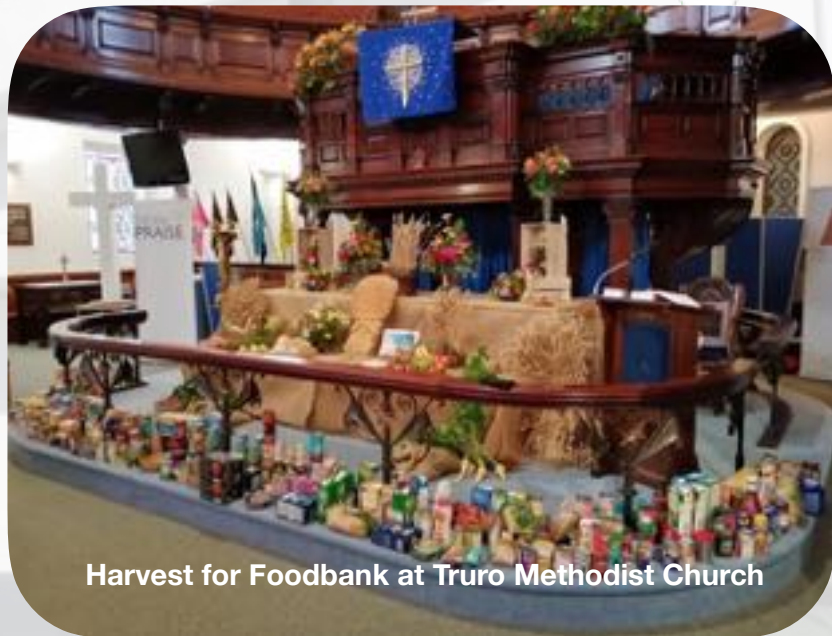
Harvest for Foodbank at Truro Methodist Church

August and September have been two of our busiest months ever with a 25% plus increase in the number of people needing our help over the same period last year. This has meant that we have distributed nearly 30% more food than we have received in these two months. However we are now in our busiest time of year as we receive Harvest donations and as we approach the Tesco national Foodbank collection event.